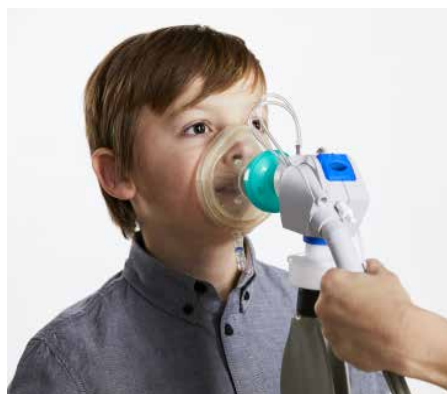
Patient interface for children and adults.

During a rapid rebreathing manoeuvre, where the patient breathes a slightly oxygen enriched gas mixture from a rubber bag through a CO 2 absorber, the tracer gas SF 6 is washed in and equally distributed in the lungs. Rebreathing is significantly quicker than a multiple-breath open-circuit manoeuvre. When wash-in is completed as determined by the device, the multiple breath wash-out test starts.