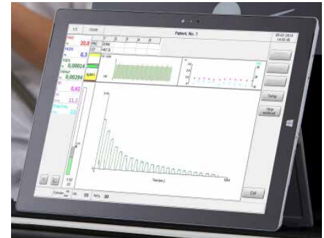
Intuitive Windows Software for effortless operations.

A Nafion sampling tube ensures optimal humidity removal.