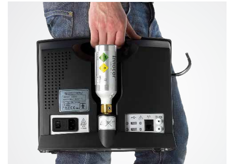
Space efficient and portable with integrated lifting slot.

Miniature gas cylinder with self-dispensing valve for rebreathing gas mixture.