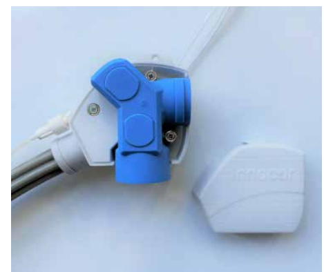
Pneumatic rebreathing valve with replaceable insert for maximum hygiene.

Quick connector panel for rebreathing valve and SpO 2 sensor.