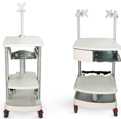
1-cylinder holder (left) and 3-cylinder holder (right) carts